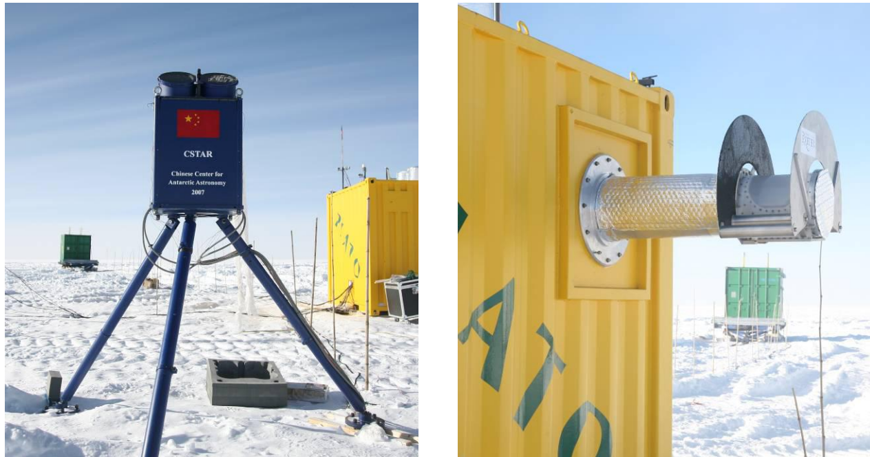
Fig. 3. Left: the CSTAR optical telescope array tripod-mounted on the snow surface. Right: the Pre-HEAT sub-millimetre telescope mounted through the PLATO instrument module side wall. The PLATO engine module is located in the background of both pictures.

Pre-HEAT is designed as a light weight, low power, fully autonomous instrument. It consists of a 0.2 m f/5 parabolic mirror at the end of an enclosed telescope assembly tube which mounts through a port in the PLATO side wall. The mirror scans the sky in elevation and has a co-rotating external (teflon) window. The receiver, a 660 GHz Schottky diode system, is mounted inside PLATO on a sensor assembly unit which also houses the IF processor, IF power detector, and digital FFT spectrometer. Pre-HEAT uses a PC104 single board computer with 8 GB flash disc hard drives.